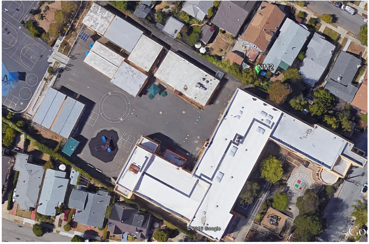
Figure 1 Area site plan and Noise Monitoring Location